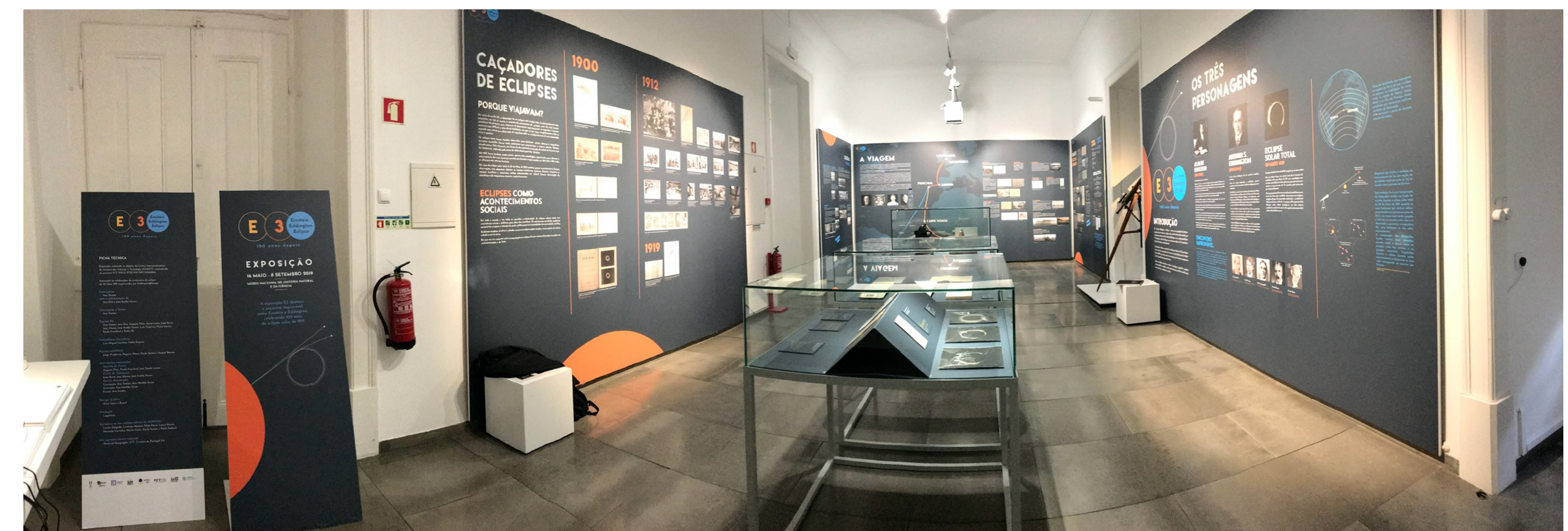
TEIA DE PESSOAS CONHECIDAS E DESCONHECIDAS, ANIMAIS, PLANTAS, AMBIENTES